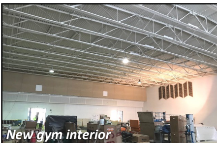
New gym interior

Kyle Rydell Superintendent/K-8 Principal (509) 245-6213 Mobile: (509) 370-4079 krydell@libertysd.us