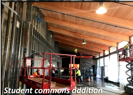
Student commons addition